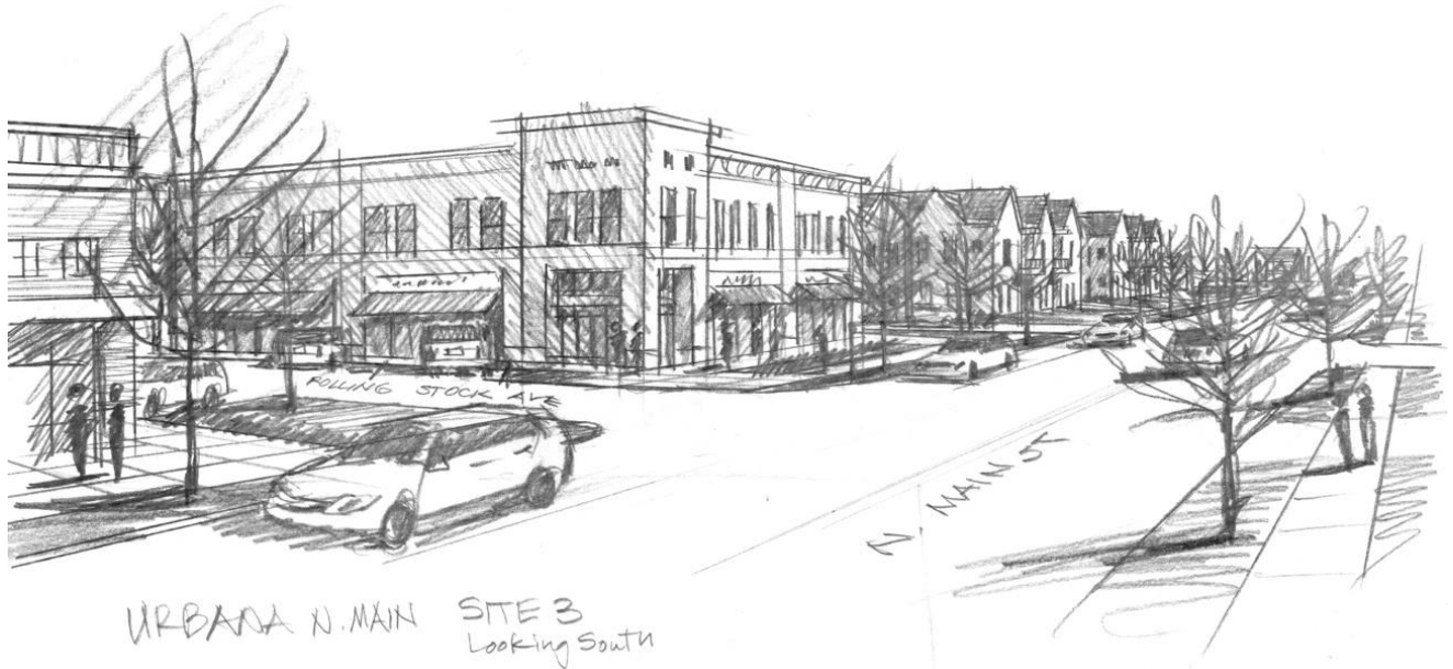
Figure 7: Site C Visionary Rendering

For the third site (Site C), located along the eastern side of Main Street between Taft and Poe Avenues, stakeholders and residents felt that the visionary rendering (Figure 7 below) provided a good mix of architectural styles that fit the age and character of the town. They viewed the redevelopment as a nice idea for how to improve the building frontage along the corridor and appreciated the blending of land use types (residences with commercial). Comments also praised the sites landscaping, sidewalks, and general character.