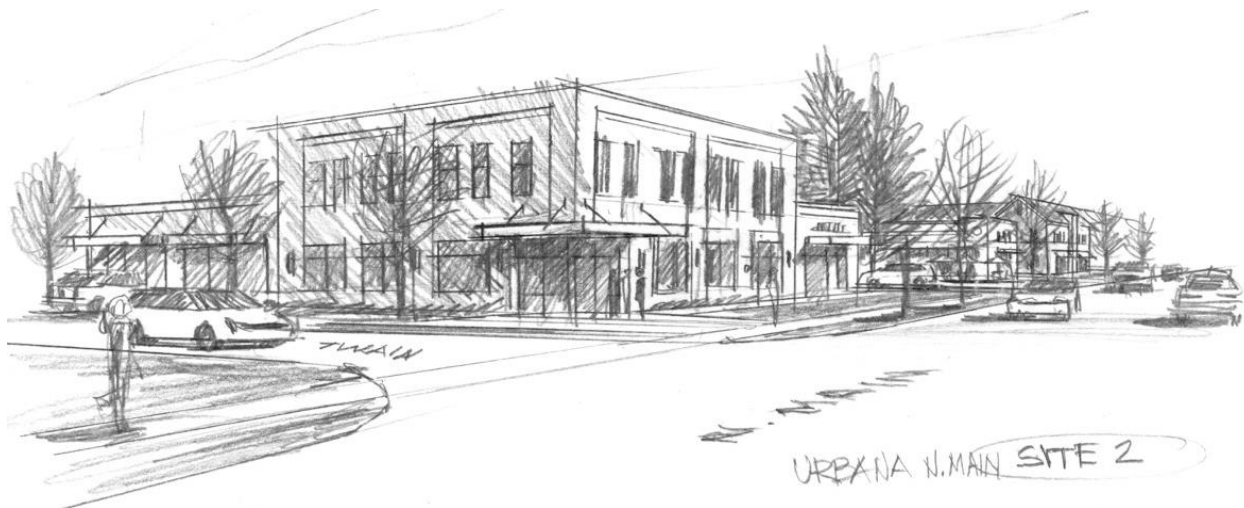
Figure 6: Site B Visionary Rendering

For the second site (Site B), located at the northwest corner of Main Street and W Twain Avenue, stakeholders and residents felt generally positive about the visionary rendering (Figure 6 below), with some comments stating that it is preferred the most out of the three. Further comments address the opportunity of the site, and prefer the building's closer proximity to the street, as well as the landscaping and sidewalk implementation. They also felt that this site was the best for multifamily dwellings such as townhouses or row housing, or as a mixed-use development.